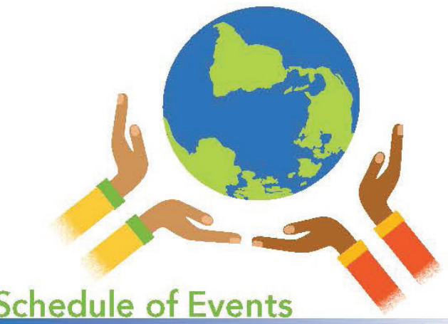
THURSDAY, OCTOBER 18